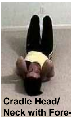
Cradle Head/ Neck with Fore- arms