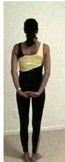
From the back

Clasp your hands behind your back. Take a deep breath and raise your arms as high as possible behind you, as you try to squeeze your elbows together. Push your chest up and out toward the ceiling.